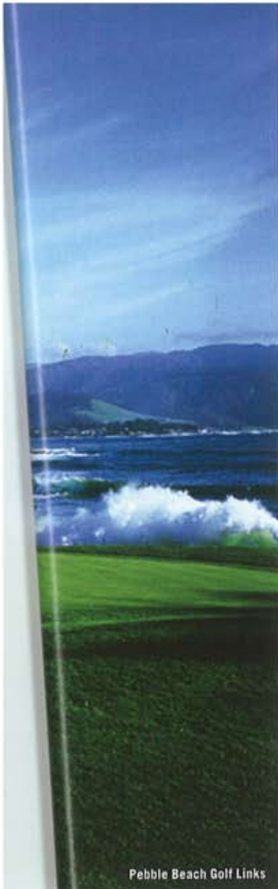
Pebble Beach Golf Links

OUR SEASONS LAS COLINAS, is in its year on the list. (Note: The Hall of Fame, next to the Pro Shop, is missed for its trove of Byron Nelson memorabilia.) Our other try is the FAZIO CANYONS AT BARTON CREEK.