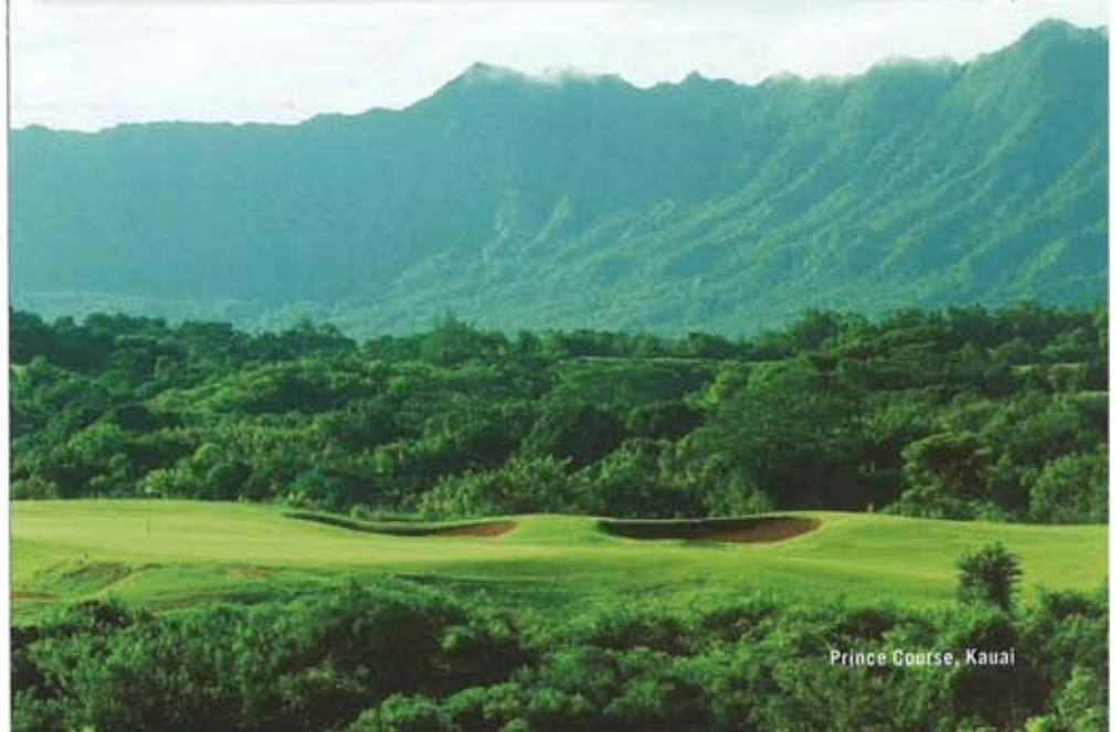
Prince Course, Kauai

Like the windswept WHISTLING STRAITS (tied with it), is BANDON DUNES.