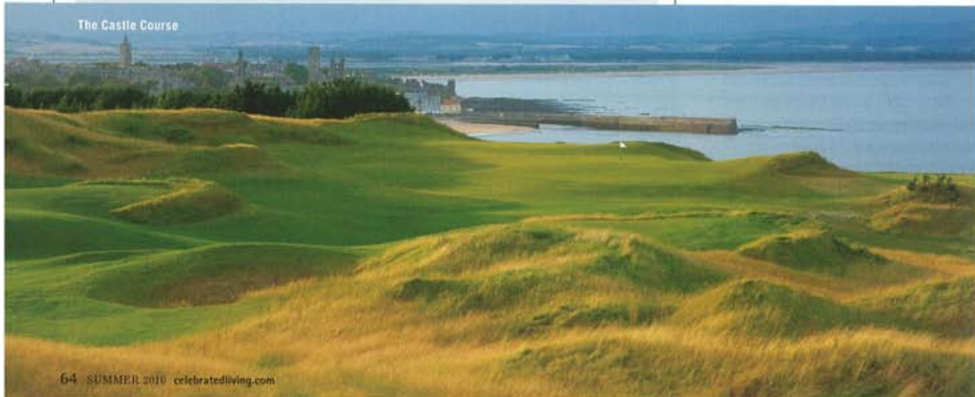
The Castle Course

THE OCEAN COURSE at Kiawah Island Golf Resort will be the 2012 PGA Championship site, and designer Pete Dye is already tweaking the course in anticipation. ►