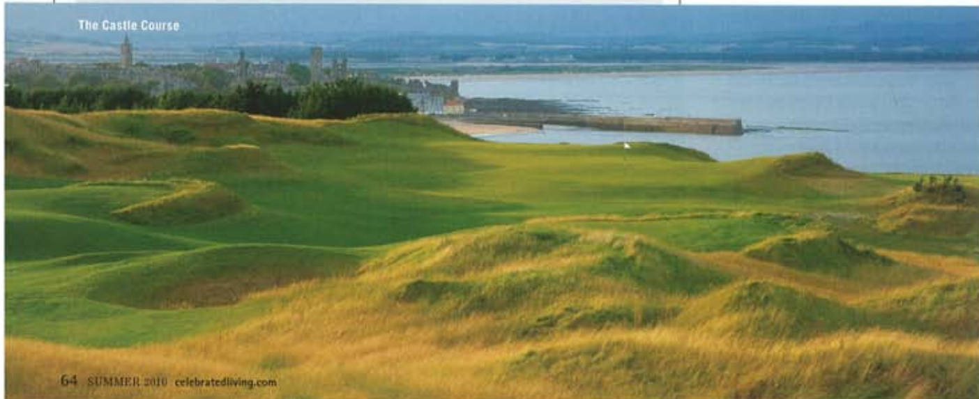
The Castle Course

THE OCEAN COURSE at Kiawah Island Golf Resort will be the 2012 PGA Championship site, and designer Pete Dye is already tweaking the course in anticipation. ►